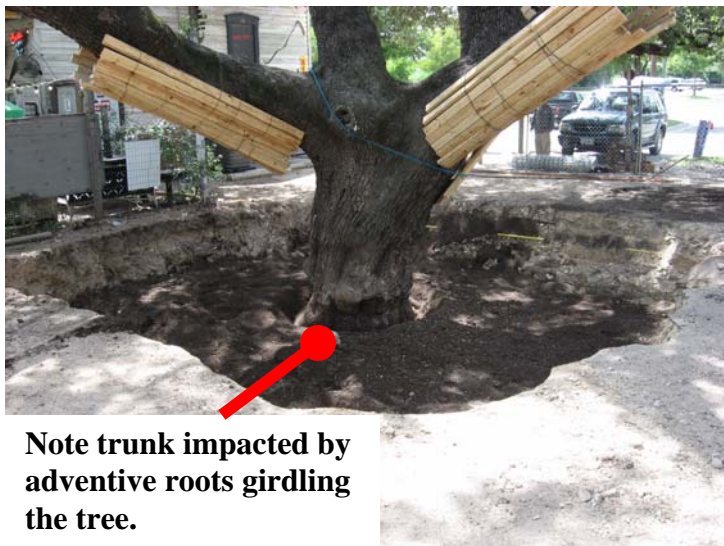
Note trunk impacted by adventive roots girdling the tree.

The arborist could now implement the Root Invigoration Program, patented by Bartlett, to help create a better environment for new root development. Developed in Austin, Texas, tested by the Bartlett Tree Research Laboratories, and used internationally, this process incorporates organic matter and fertilizer into the critical root zone to help promote new root growth. This program aids in root growth, greatly improves health of a stressed tree, and also functions proactively to maintain tree health.