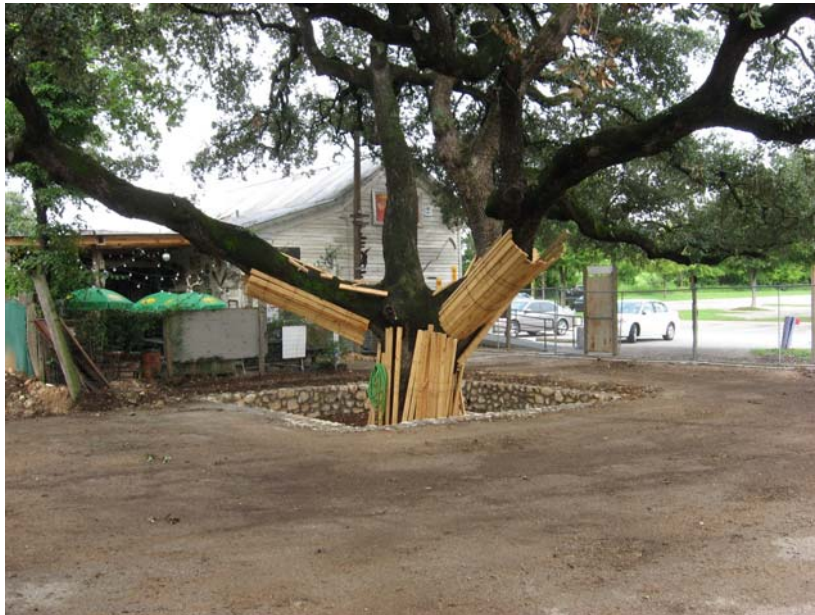
Figure 6: Completed excavation and retaining wall.

Finally, crews installed additional physical protections. First, they placed plywood in the newly excavated tree well to prevent compaction from foot traffic and building materials during construction of a retaining wall around the hole's perimeter. This wall would function in several protective ways: to prevent soil from collapsing back into the tree well and to create a protective moat against construction equipment and foot traffic. Finally, the crew installed a permanent fence at the drip line to increase the likelihood that this valuable tree would be amply protected. All of these measures, along with a monthly Plant Health Care Monitoring Program for the duration of the construction project should give George every chance to thrive and grace the new development for many years to come.